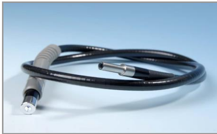
Liquid Lightguides available in 1-, 2-, 3-, & 4-pole configurations (see Table 1 on Page 3 for sizes and part numbers )