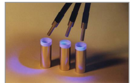
Trifurcated wand curing metal-to-plastic assembly

1 As measured with a Dymax ACCU-CAL™ 50 Radiometer (320-395 nm) and Lightguide simulator. Excessive on/off cycles and improper cooling may affect bulb degradation and therefore no warranty is expressed or implied.