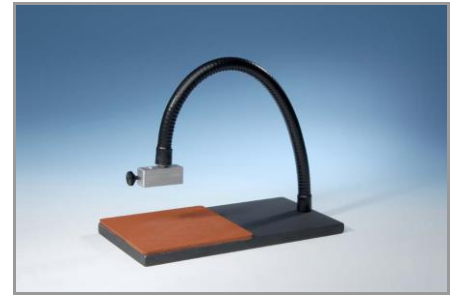
Lightguide Mounting Stand (fits 3 mm, 5 mm and 8 mm lightguides) PN 39700