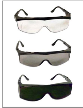
UV-Blocking, Over-the-Glasses Eye Protection Clear PN 35284 ■ Tinted PN 35285 Dark Tint PN 35286